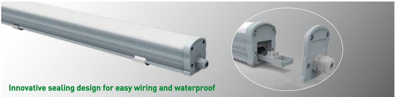
Innovative sealing design for easy wiring and waterproof